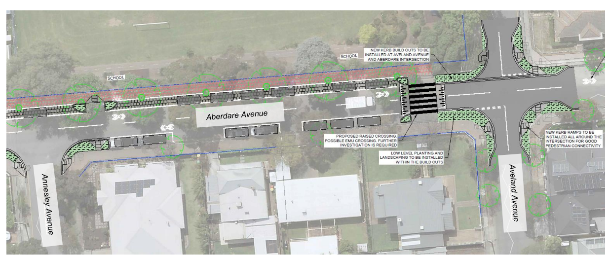
Aberdare Avenue: Annesley Avenue to Aveland Avenue