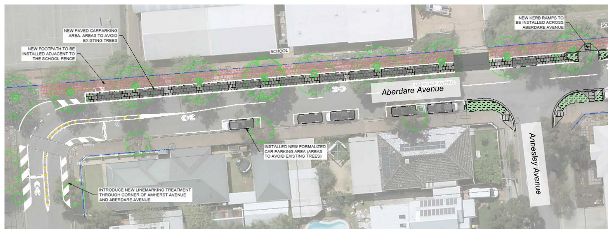
Aberdare Avenue: Amherst Avenue to Annesley Avenue