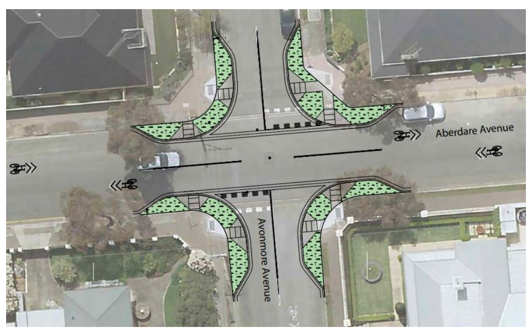
Aberdare Avenue and Avonmore Avenue

Landscaped kerb buildouts and new kerb ramps at the intersections of Avonmore, Ashbrook and Canterbury Avenues to reduce the road crossing distance for pedestrians, improve sight distance between motorists and pedestrians, moderate vehicle speeds and provide landscaping opportunities.