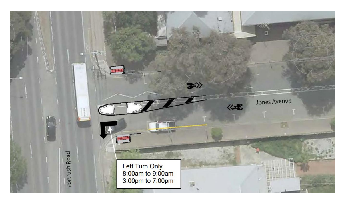
Portrush Road and Jones Avenue Junction