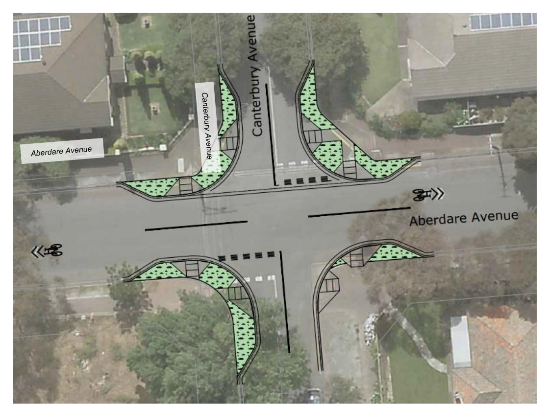
Aberdare Avenue and Canterbury Avenue